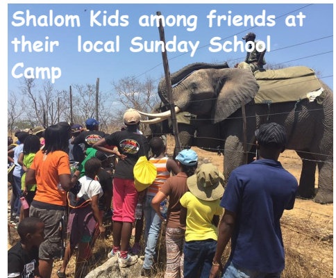
Shalom Kids among friends at their local Sunday School Camp

We have been so heartened by the continued commitment of a father who maintains contact with his children, visiting them at Shalom, and bringing gifts when he can. After tragically losing his wife, and the mother of his 3 children in childbirth, he voluntarily opted, due to extremely tough circumstances, to have his children placed and cared for at Shalom. What a selfless act of a father wanting the best for his children.