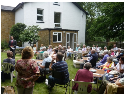
Vicarage tea party