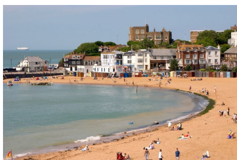
Church annual trip to Broadstairs